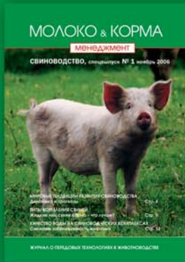
"Pig Farming" issue